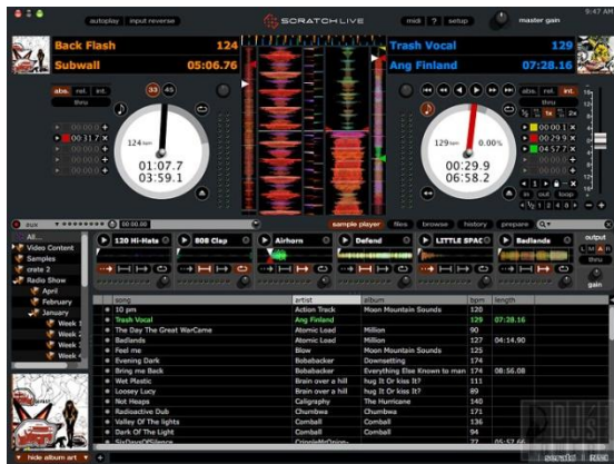
Serato Digital DJ Software Highly professional world renowned DJ software