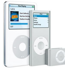
iPod – Classic, Nano, and Shuffle Should never be considered DJ equipment