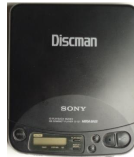
Sony Discman If this is DJ equipment then you're probably already a DJ.