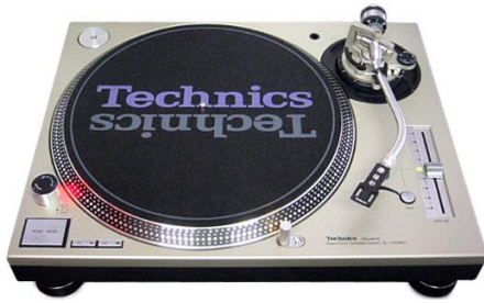
Technics SL-1200 Highly professional DJ equipment.