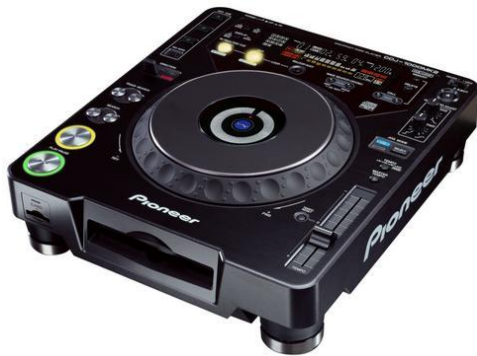
Pioneer CDJ Highly professional DJ equipment